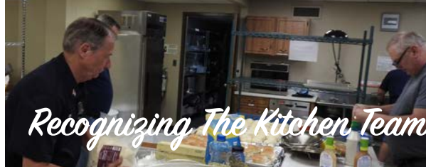
Recognizing The Kitchen Team

December 12 -Membership Meeting we will have our Holiday Gathering, including our spouses and significant others.